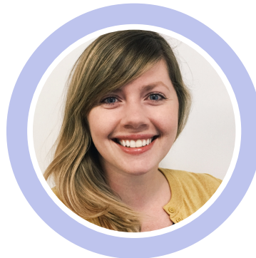
Jennifer Walker Communications